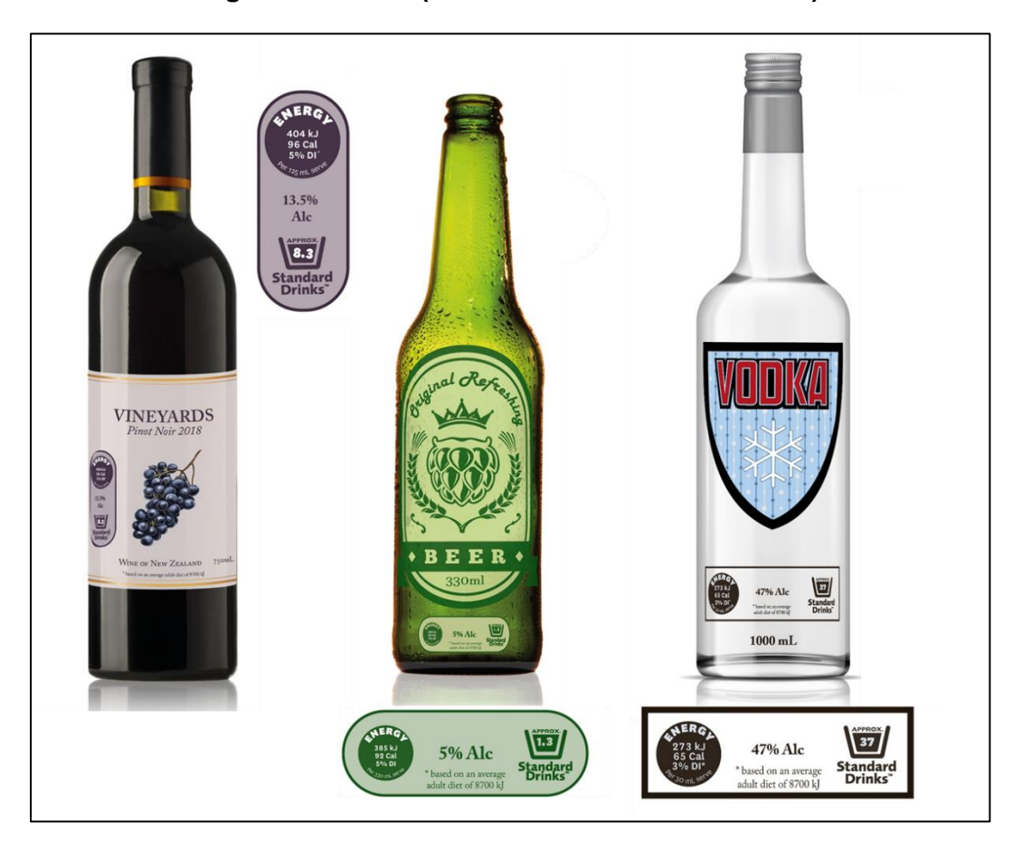
Figure 4: Label 4 (Front-of-bottle combined label)

Label 4 was a front-of-bottle label with all information (standard drinks, % alcohol content, and energy content with % DI) contained in a single label (Figure 4, Appendix 1). This label was the preferred label (of the four labels presented to the seven focus groups).