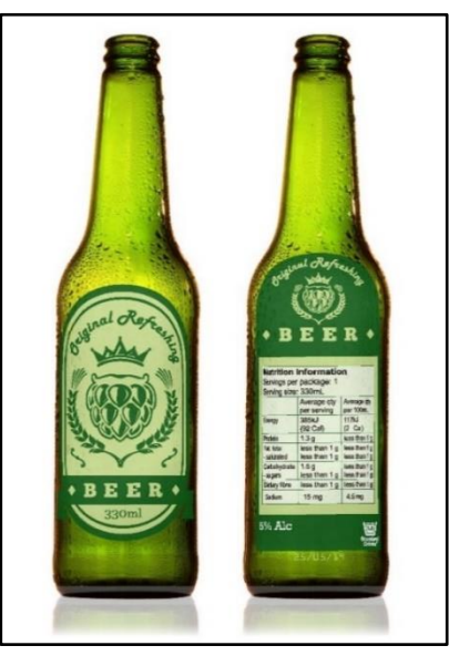
Figure 1: Label 1 (Nutrition information panel, back-of-bottle)

The NIP on the back of a beer bottle appealed only to a limited number of people (Figure 1, Appendix 1). Participants who liked the NIP stated that they liked seeing the detail about different elements in the drink and that if they wanted to see the information, it was on the back of the bottle. They also liked the familiarity of the NIP and that it was packaged in a way that