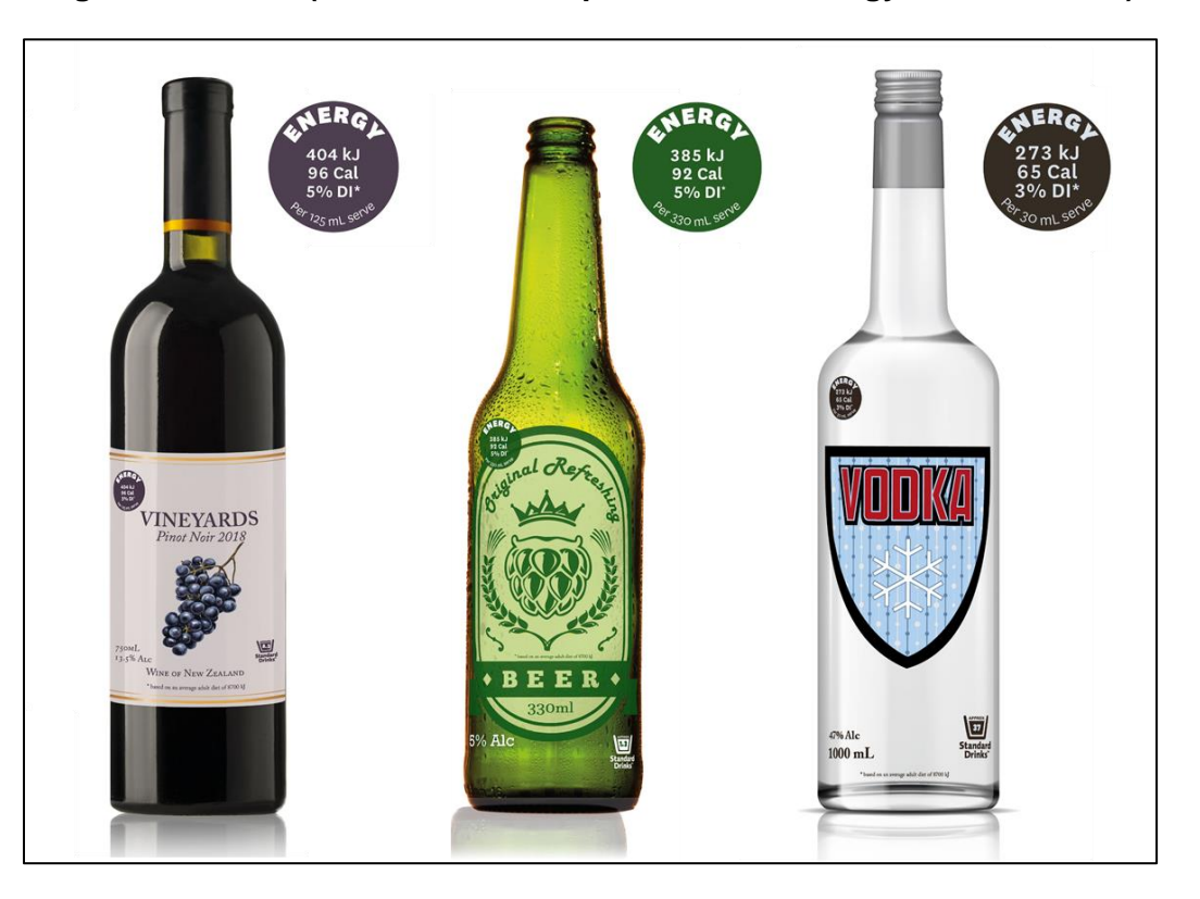
Figure 3: Label 3 (Front-of-bottle separated label, energy icon with % DI)

This label was a variant of the second label, and included % DI underneath energy content along with the words "based on an average adult diet of 8700 kJ" (Figure 3, Appendix 1). The % DI calculates the percentage of daily energy intake (based on 8700 kJ) contained in one serving. Label 3 was the least favoured label, partly because most participants did not perceive the additional information as making the label more useful.